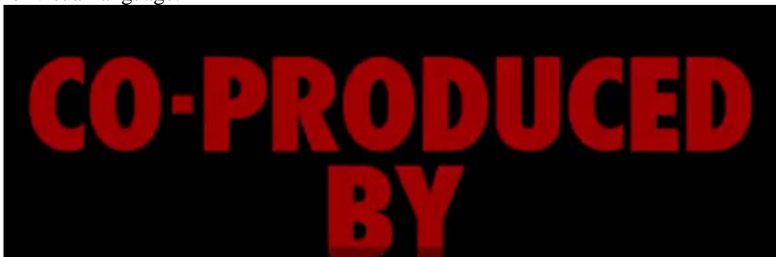
Figure 1 One of the opening shots of the movie "Escape into Nothingness"

The basic elements of visual language in motion graphic can be summarized as: graphics, color, and motion mode. Different visual language can create unique dynamic image works. According to various artistic creation needs, artists choose corresponding materials and forms of expression, apply certain principles and methods, control and adjust the relationship between various elements within a certain range, and finally form an image language that can convey specific information. Especially in the production of moving images and movies, the picture is the main narrative means. Creating a strong atmosphere in the work that can attract the audience's attention mainly depends on the use of visual language.