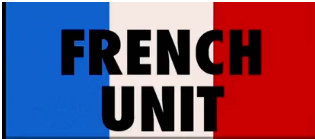
Figure 2 The second screenshot of the opening title of the movie "Escape into Nothingness"